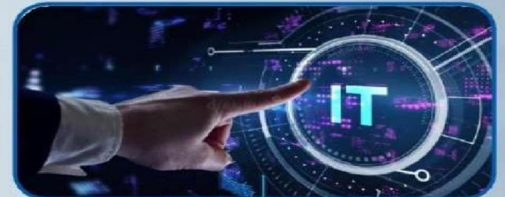
2000 Information Technology