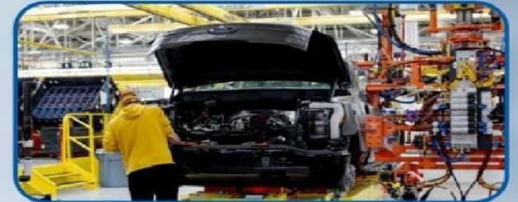
1970 Auto Mobile